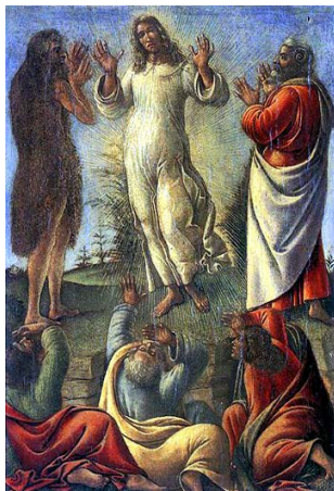
BLOOD OF JESUS

Have you been born again (Saved)? If not you can, Romans Chapter 10:9. --- If thou shalt confess with thy mouth the Lord Jesus, and shalt believe in thine heart that God hath raised him from the dead, thou shalt be saved.